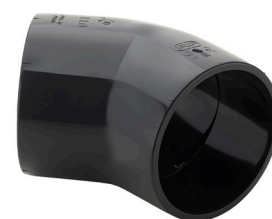
45° ELBOW WITH SOLVENT WELD SOCKETS PVC-U