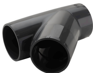
45° TEE WITH SOLVENT WELD SOCKETS PVC-U