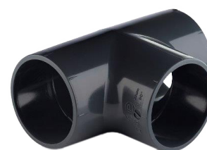
90° TEE WITH SOLVENT WELD SOCKETS PVC-U