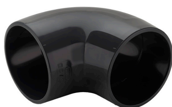
90° ELBOW WITH SOLVENT WELD SOCKETS PVC-U