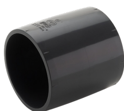
SOLVENT WELD DOUBLE SOCKET PVC-U